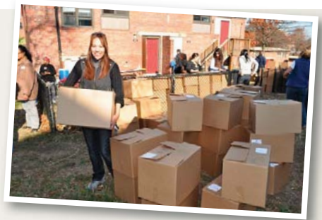
DayBreak partnered with McLean Bible Church to distribute 450 turkey dinners at Thanksgiving.

the time to pray with residents and talk with them about Jesus Christ. 450 households were blessed with physical food but were also introduced to or reminded of Jesus, the Bread of Life!