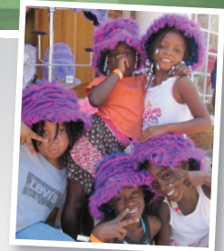
DayBreak kids at Six Flags.