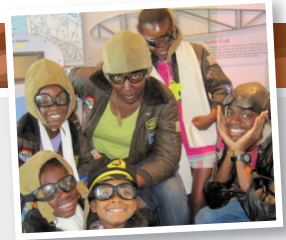
Experiencing Aviation Museum!

In addition, I would like to highlight a couple of things that are not new to our program but are an important part of what we do. Our parent prayer breakfast was started last spring and held every other week. Per the parents' requests, we will be meeting weekly, continuing to have breakfast together, fellowship, and study the Bible. Additionally, parents will come in to cook for the kids on the nights they have tutoring. This serves as a great opportunity for